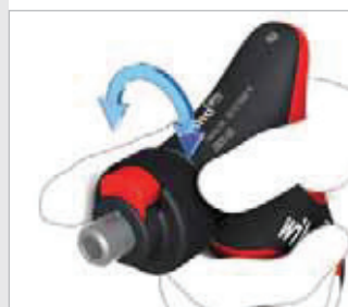
Finely toothed, switchable ratchet