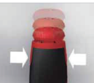
Bit magazine opens at the press of a button.

Making a particularly powerful entrance – the new Topra 2K with six 25mm bits cleverly located in the ergonomic pistol handle. In addition, there is a finely serrated, switchable ratchet with bit holder.